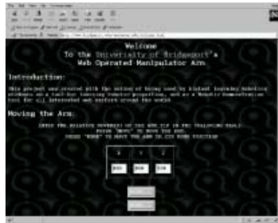
Figure 1: The coordinate system interface

As written earlier, the modularity of the system enables the creation of different user interfaces which are using the same link to operate the robot. Currently, two user interfaces are available: the coordinate system interface (see figure 1), and the stereoscopic visual interface (see figure 2 and figure 3).